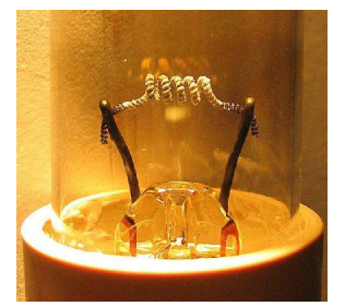
Fig. 2 Fluorescent light filament

Filament: When the tungsten (W) filament is heated, its special coating will boil off electrons, not light. If the coating is too thin, it will fail early because of the sudden heating at turn-on can cause expansion, cracking or flaking. Care must be taken to keep the tungsten from evaporating onto the tube inner wall; it can lead to a thick opaque layer, blocking light.